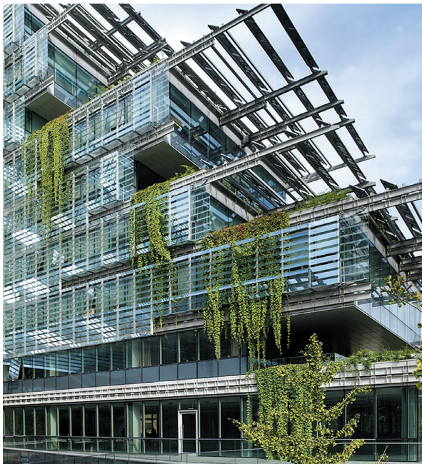
◆ School of Environment Tsinghua University

GEP was initiated in School of Environment in 2011 and was promoted to a university level program in 2013 after two years' trial.