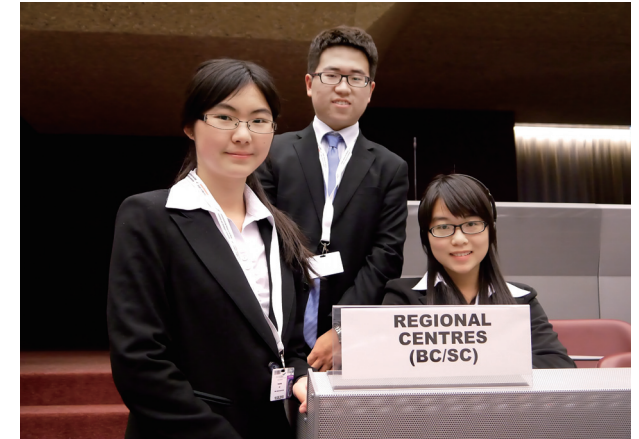
◆ GEP students at the conferences of the parties to the Basel, Rotterdam and Stockholm Conventions in Geneva, Switzerland. (May, 2013)

Fully financially supported by SOE and supervised by national upmost experts, each GEP student is required to be involved at least once in international environmental negotiations, obtaining in-person experience in international environment affairs and founding solid base for future career development.