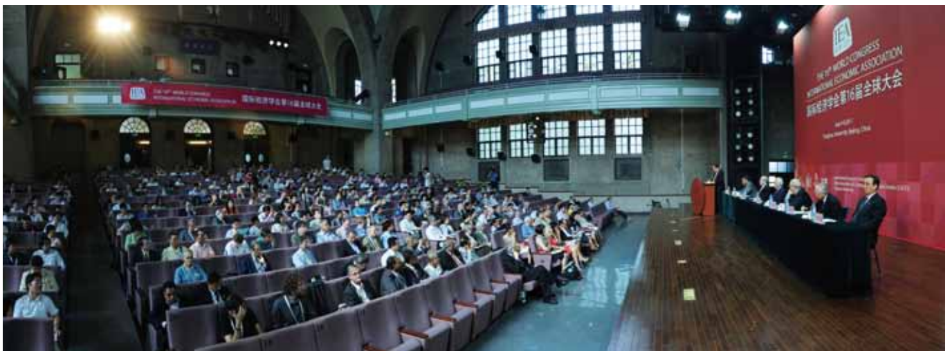
Opening Ceremony of the 16th World Congress of International Economic Association

The International Economic Association was founded in 1950 as a non-governmental organization at the instigation of the Social Sciences Department of UNESCO.