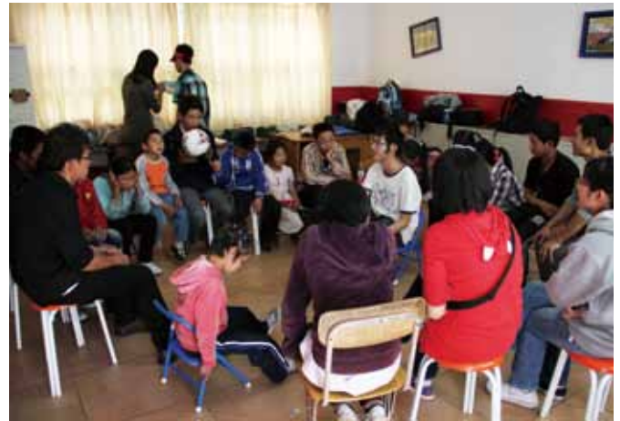
Tsinghua students teach blind kids in Lhasa, Tibet

In this centenary year of Tsinghua University, many students were inspired by visiting places where alumni have made great contributions to the society.