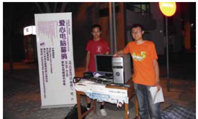
Tsinghua students collect donated computers for students in poor areas

A total of 5,637 students formed 601 teams for social practice this summer. About half of the students participated in the social investigation program. Some teams joined the Education-Aid-the-Poor program in remote and impoverished counties in China's western area. Some teams participated in the internship programs organized by various departments.