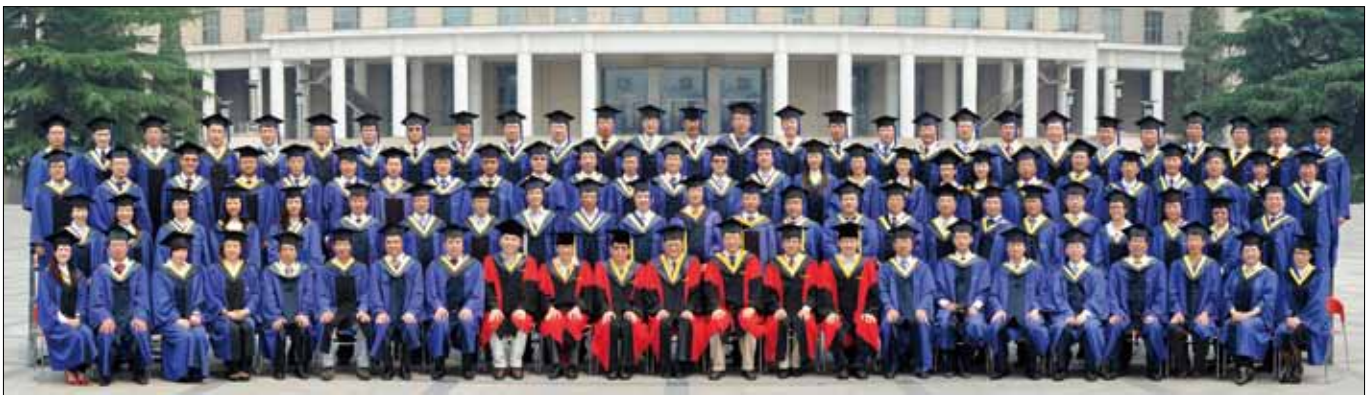
2011 EMBA Graduates of the School of Economics and Management

Since its inception in 2002, over 3,400 students have been conferred Master's degrees through Tsinghua's EMBA program.