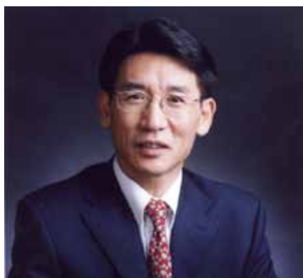
Professor Xue Qikun