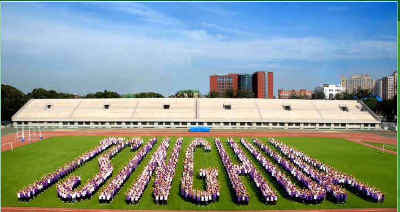
1,700 students spell out Tsinghua