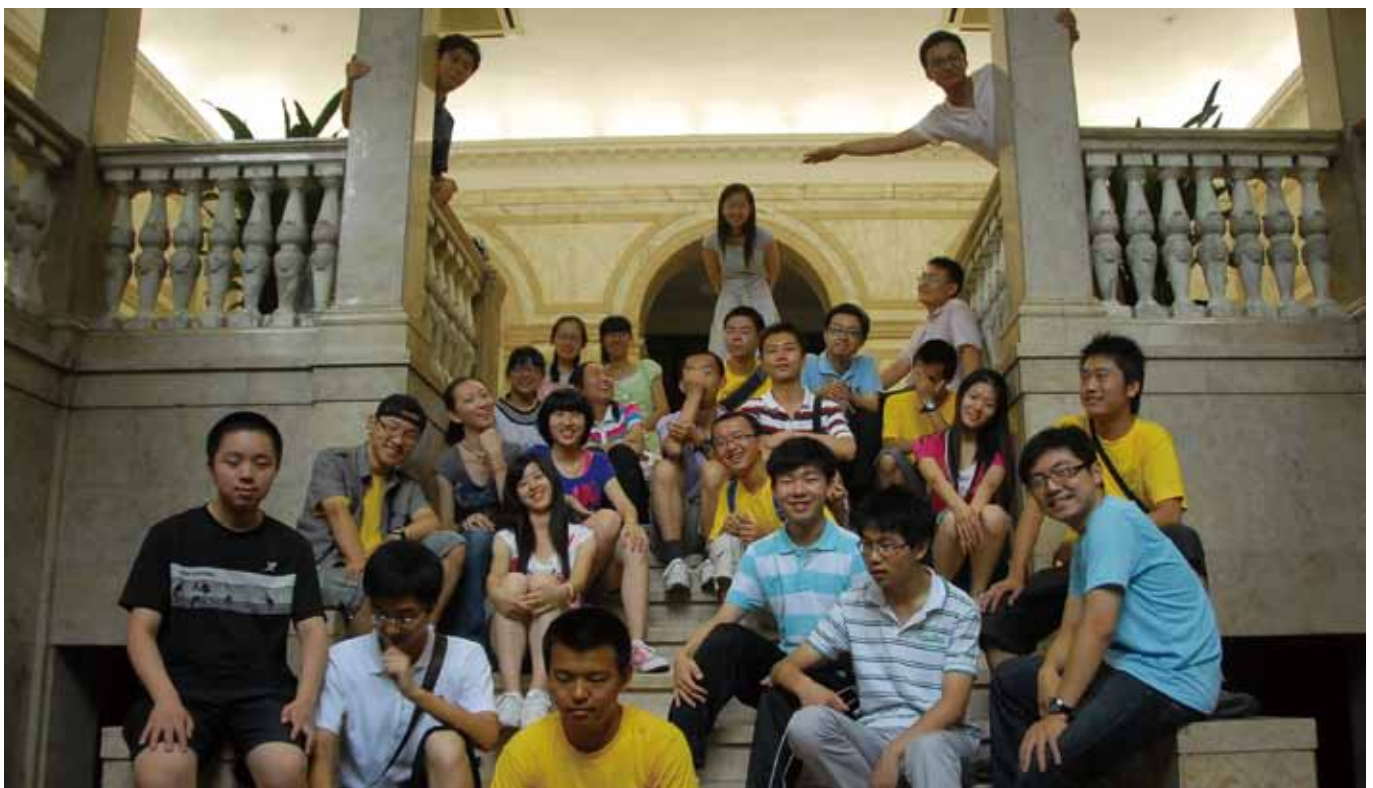
New students enrolled under students supporting program in the library

Students selected into the program will have 30 to 60 points added to their college entrance examination scores. They will also be offered financial support and work-study programs when they are enrolled into Tsinghua.