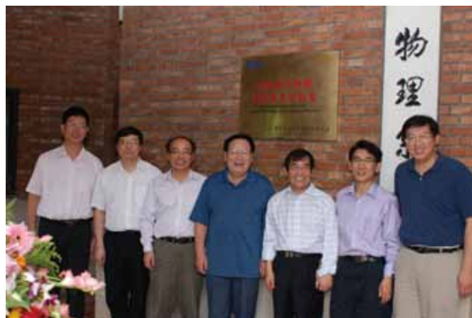
University leaders, government officials and faculty members unveil the LLDQP