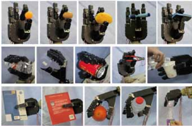
COSA Hand Grasping Experiment

The competition is composed of four divisions: undergraduate robot division, graduate robot division, undergraduate mechanism design, and graduate mechanism design. There’s one first place award in each division. It is an annual event jointly supported by American Society of Mechanical Engineers (ASME) and the National Science Foundation of USA (NSF), with participants from dozens of countries and regions around the world.