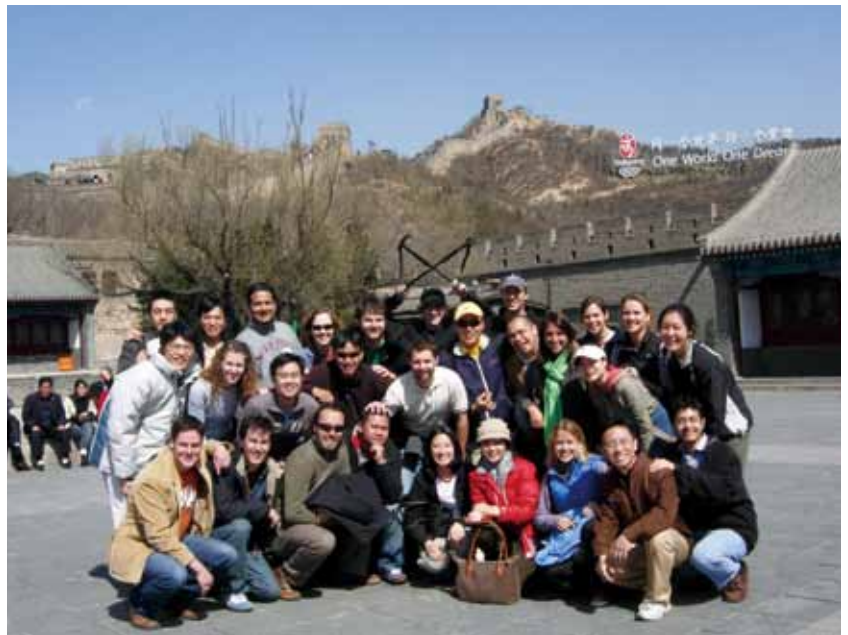
American Students in China

US First Lady Michelle Obama delivered a speech at Howard University during Chinese President Hu Jintao visited to the United States in January 2011. She said, “Whether it’s climate change or terrorism, economic recovery or the spread of nuclear weapons, for the US and China, the defining challenges of our time are shared challenges. Neither of our countries can confront these alone. The only way forward, the only way to solve these problems, is by working together.”