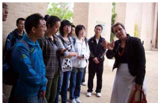
Visit to Oxford Said Business School