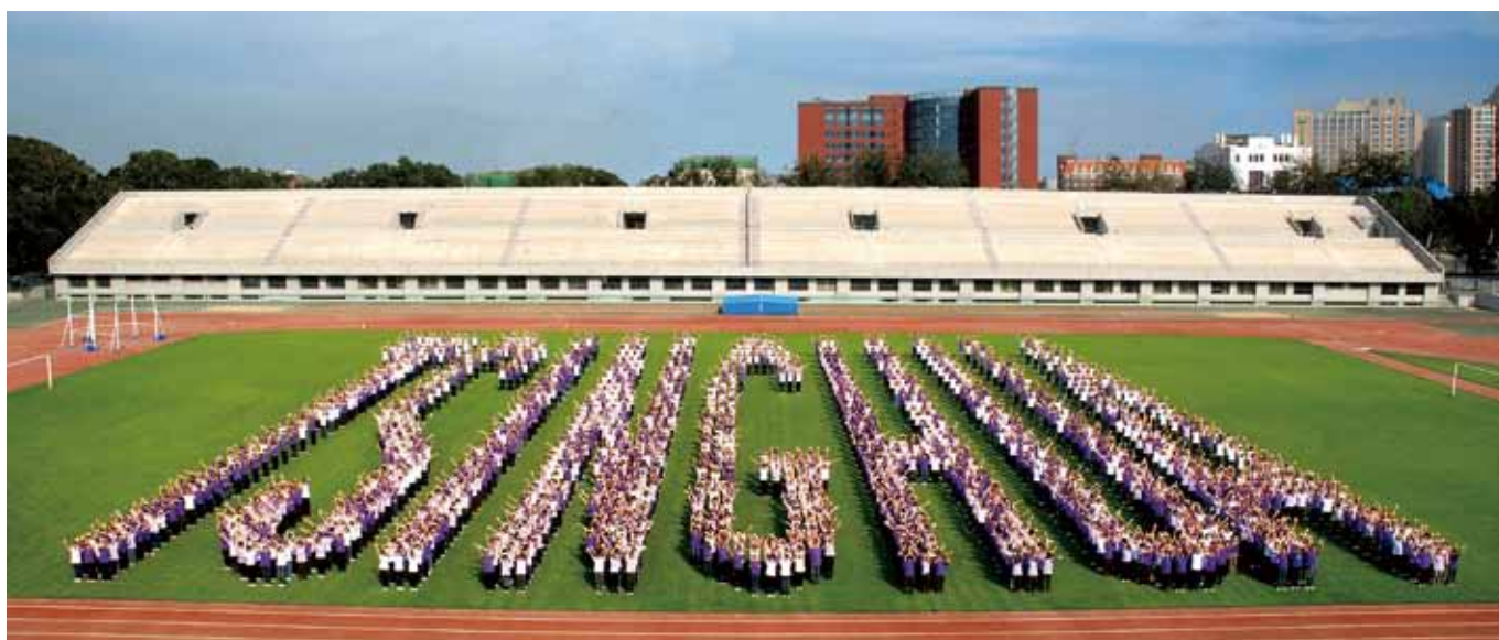
Freshmen “spell out” the Alma Mater

The newly enrolled international students all arrived at Tsinghua by the end of September. Over 3,400 students from 112 countries are studying here this semester, marking a record high. Nearly 1,200 of them are studying in postgraduate programs.