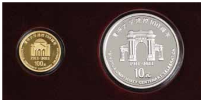
The gold and silver commemorative coins

collectors and have hit high prices in the coin collection market.